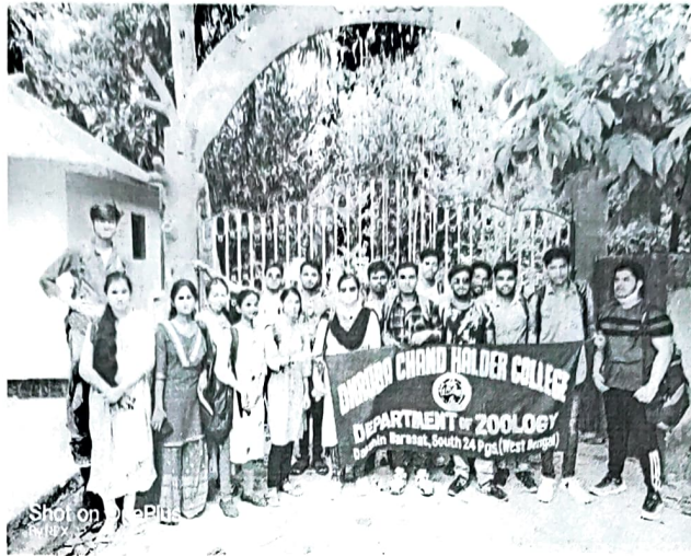
GROUP PHOTO IN FRONT OF CKBS