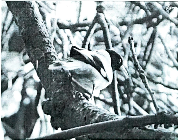
BLACK HOODED ORIOLE